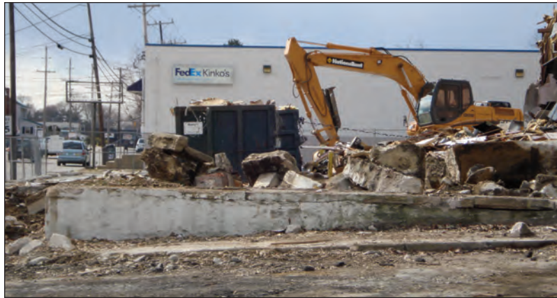
Last week, demolition at the Grainery Station was almost complete, with only the front sidewalk and a bit of the foundation remaining of our old location. Imagine the surprise when someone who hasn't heard about our big move stops by to pick up a little something at the Gallery Shop ...

In between newsletters, we’ll post updates on the Web site, or you can get NAA updates delivered direct to your e-mail box. Just call or e-mail and ask to be added to the list.