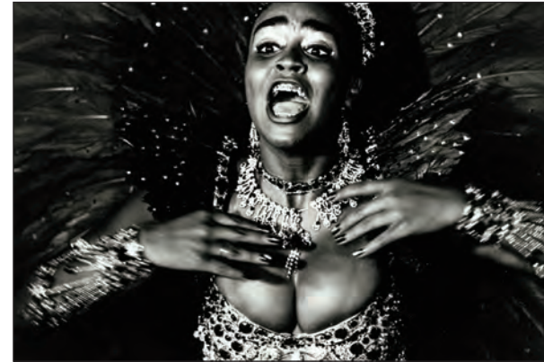
First-place winner: "Vital Essence - Latin America Series - Rio de Janeiro, Brazil," by Peter Prusinowski

The NAA's Exhibition Committee decided it was time for the NAA to try a show that solicited entries from across the U.S. The gamble paid off.